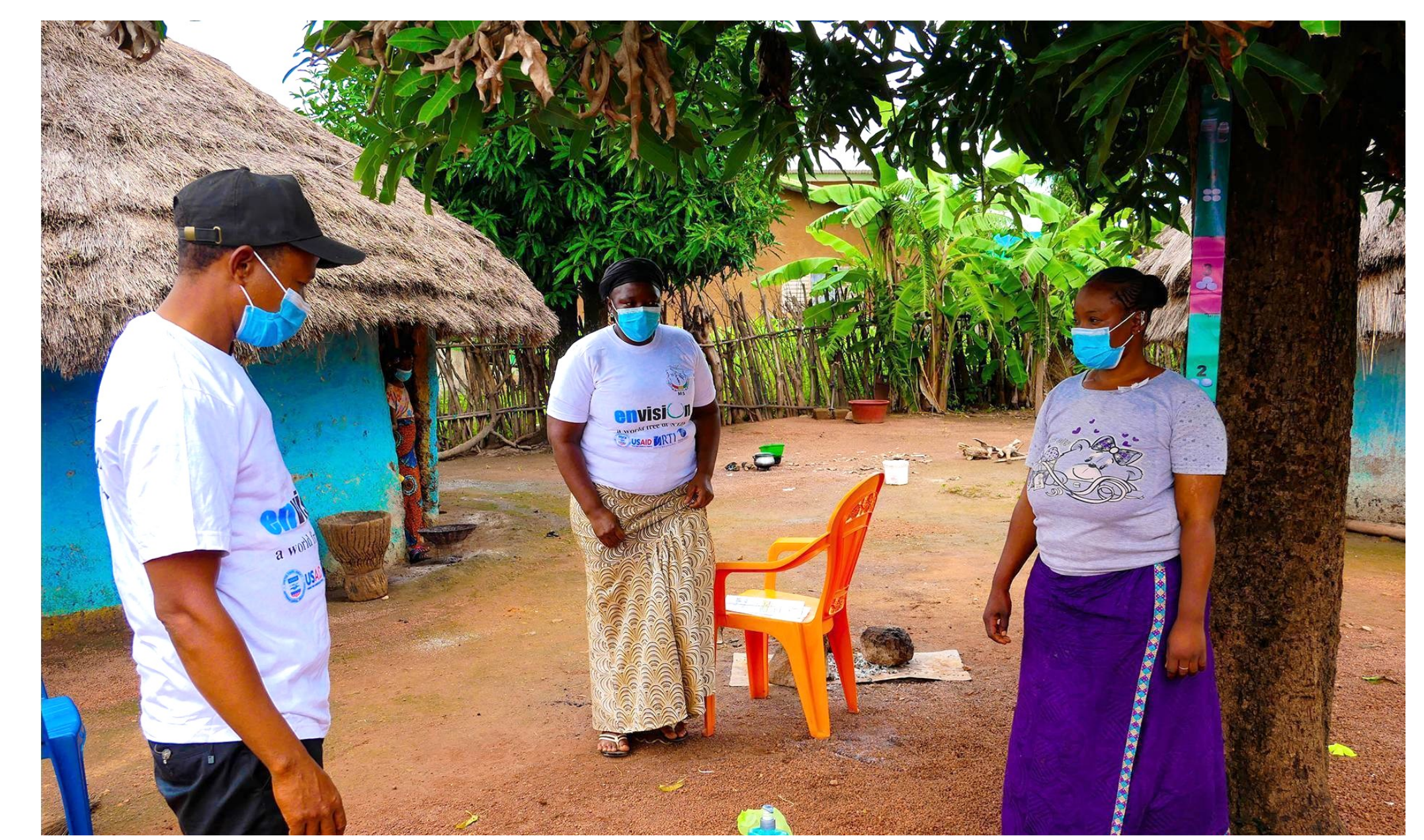
Figure 1. CDDs and a participant during an MDA in Guinea. All individuals are correctly wearing a mask and maintaining physical distancing. A dose pole can be seen attached to a tree.

Compliance with COVID-19 preventive and barrier measures during MDA and DSA was high, except mask-wearing among participants.